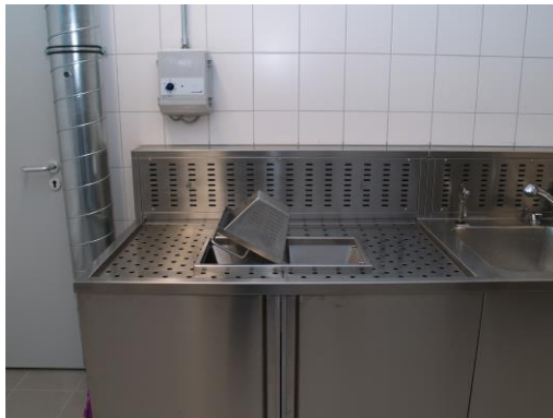
Sieve inserts for separating liquids from solids