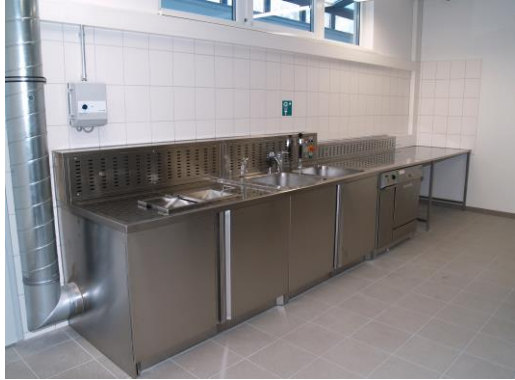
Individual solution with basin, disinfection system and working table