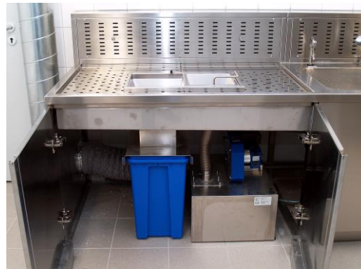
Disposer for solids / 60 litres container with formalin pump with automatic pumping system (customized solution)