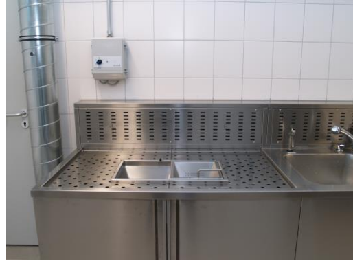
Disposal station with sieve insert and ventilation system (downdraft and backdraft)