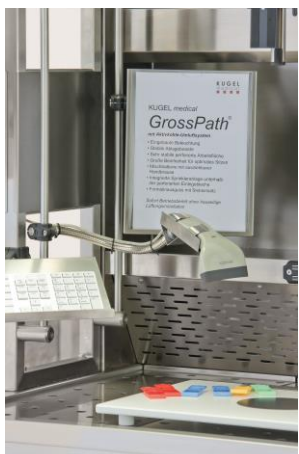
Swivelling scanner holder laterally mounted to the side rails FH-SCAN-SS-300 Art. No. 060.100.105