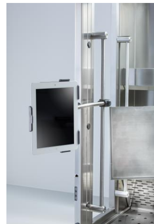
Flexible iPad/tablet holder laterally mounted to the side rails FH-TABLET-SS-300 Art. No. 060.022.036