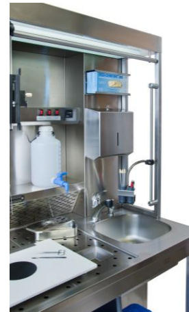
Glove holder made of stainless steel HHK-UCS-BEA Art. No. 060.020.070