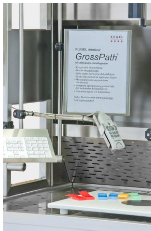
Flexible microphone holder laterally mounted to the side rails FHH-SS-300 Art. No. 060.015.036