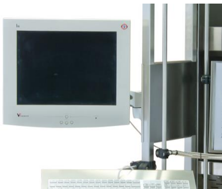
Monitor holder MT-SS laterally mounted to the side rails Art. No. 060.022.033