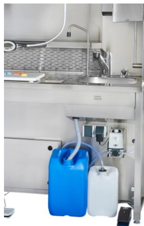
Formalin-dispensing system FDS-05/1-F Art. No. 060.012.024