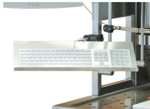
Keyboard holder THB-SS laterally mounted to the side rails Art. Nr. 060.022.080