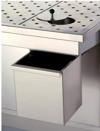
Waste shaft with extraction and stainless steel waste bin MÜ-AS-150-M Art. No. 060.012.056