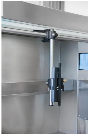
Camera holder mounted to the railing system KA-H-400 Art. No. 060.015.085