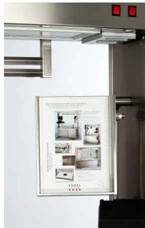
Swivelling document holder laterally mounted to the side rails DH-A4-SS Art. No. 060.012.031