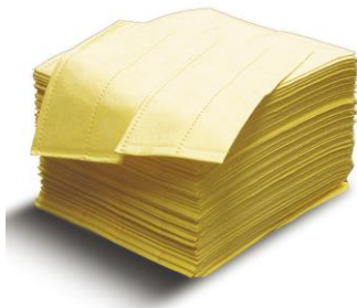
Mats special superior sorbents ABS-M-200 Art. No. 090.020.600