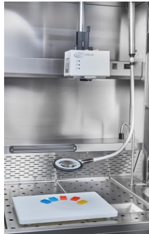
Magnifier with illumination mounted to the railing system LL-WM72-RS Art. No. 060.016.065