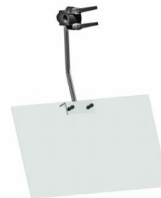
Flexible splash guard mounted to the railing system FSS-500 Art. No. 069.300.248

KUGEL medical GmbH & Co. KG Hermann-Köhl-Str. 2A DE - 93049 Regensburg/Germany