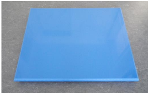
Cutting board made of polyethylene - blue SB-PE-50/40-BL Art. No. 060.012.119