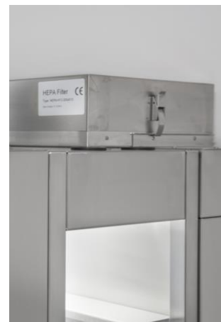
HEPA filter system mounted (only available for GrossPaths!) HEPA-GP-1500 Art. No. 060.260.070

KUGEL medical GmbH & Co. KG Hermann-Köhl-Str. 2A DE - 93049 Regensburg/Germany