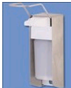
Wall dispenser for - disinfectants WS-DM-100 Art. No. 090.320.015