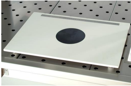
Cutting board made of Corian with a round black point SB-CO-50/40-SE Art. No. 060.012.012