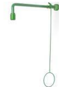
Wall mounted body shower KW-W 020 Art. No. 060.200.100