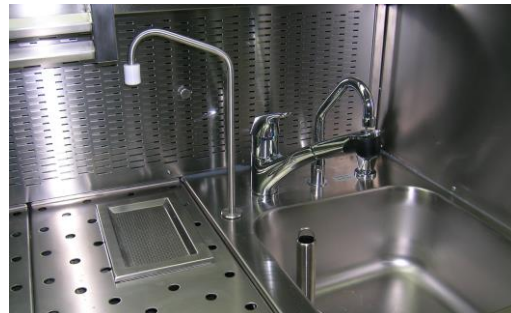
Formalin faucet with ball valve FZH-15-K Art. No. 060.012.016