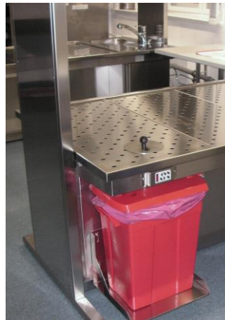
Waste shaft with extraction and PVC waste bin MÜ-AS-150-M-K Art. No. 060.012.057