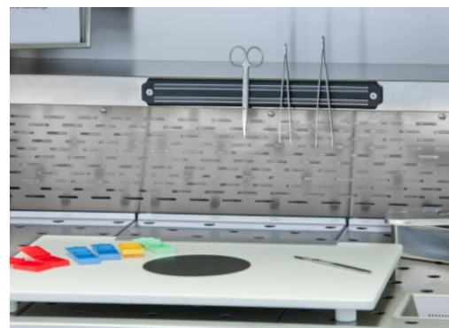
Magnetic bar for instruments mounted to the storage board MS-300 Art. No. 060.012.077