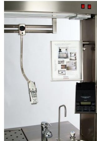
Flexible microphone holder mounted to the railing system FHH-RS-500 Art. No. 060.015.035